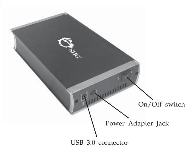
Figure 1. Back Panel Layout