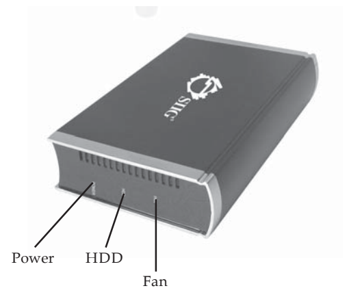
Figure 2: Front Panel