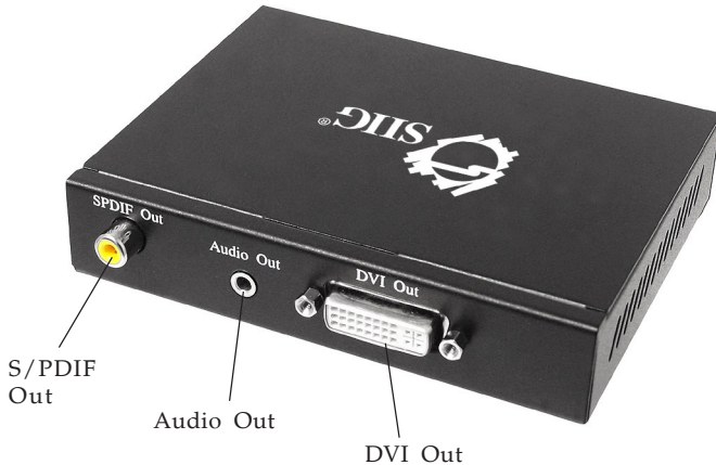
Figure 2: Rear Panel