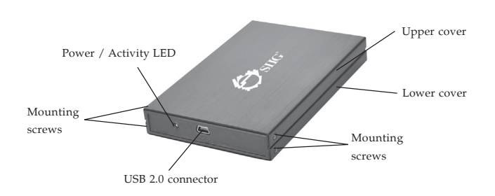
Figure 1: Layout