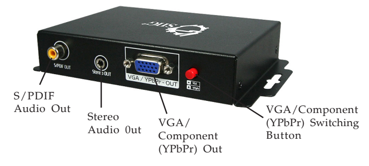
Figure 2: Rear Panel