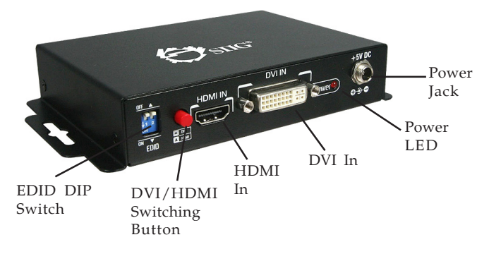
Figure 1: Front Panel