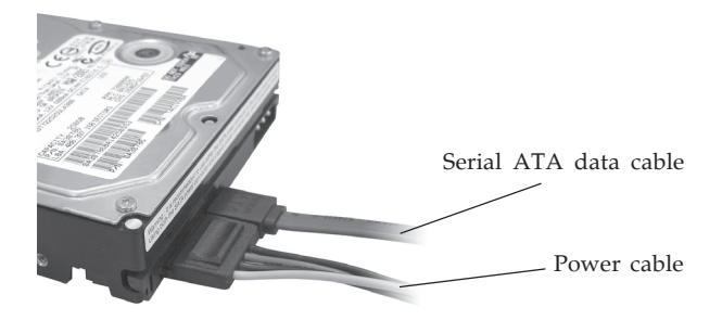
Figure 2. Hard disk drive connections

3. Connect one end of the Serial ATA data cable to the hard disk drive.