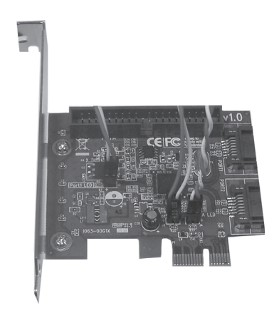
Figure 4. Connecting HDD LED

Note : If it is your desire to monitor disk activity of the Serial ATA hard drives, you may at this time connect the hard disk LED of the system case to the Hard Disk LED Pins on the Serial ATA controller.