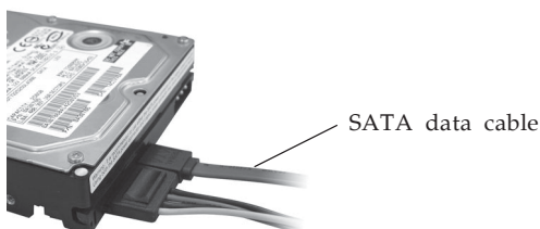
Figure 2. Hard disk drive connections