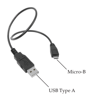
Figure 2: USB Type-A to Micro-B Cable