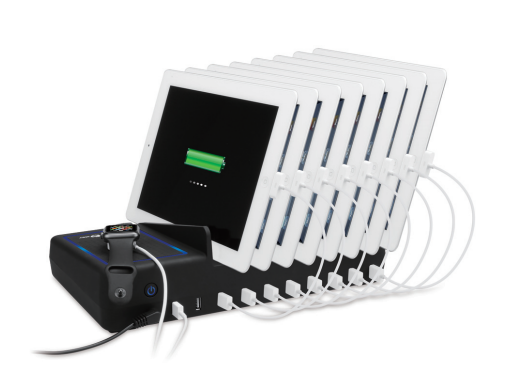
Figure 3: Application

10-Port USB Charging Station with Ambient Light Deck is an ideal charging companion which enables you to charge up to 10 USB powered devices simultaneously. Built in 8 individual open slots and a roomy padded deck keep your devices organized while charging.