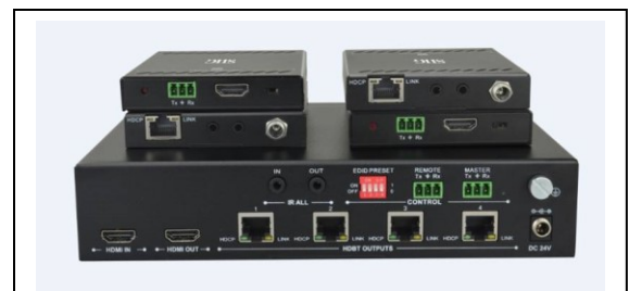
HDMI HDBaseT 1x4 1080p Extender/Splitter - 150m (CE-H24011-S1)