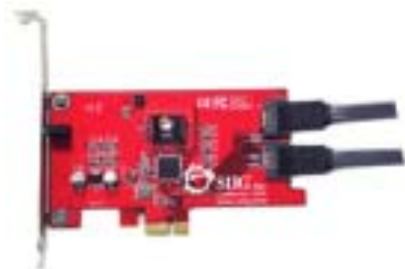
Figure 3. Connecting the Serial ATA data cable(s)