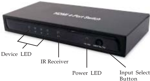
Figure 1. Front Panel Layout