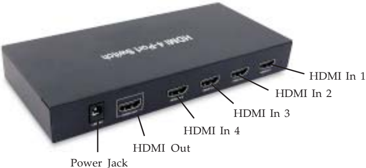
Figure 2. Rear Panel Layout