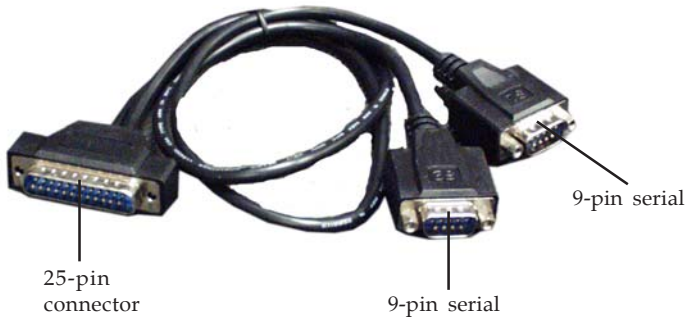
Figure 2. Fan-out cable