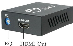
Figure 1: Front Panel