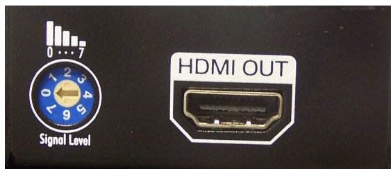
Figure 4: Front View of Receiving (Rx) Unit