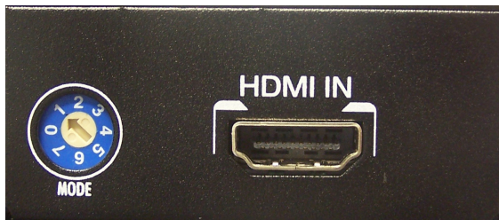
Figure 1: Front View of Transmitting (Tx) Unit