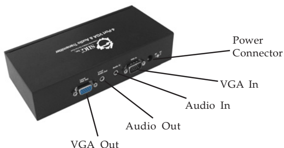
Figure 2: Back