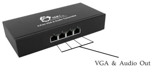
Figure 1: Front