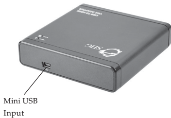
Figure 1: Rear Layout