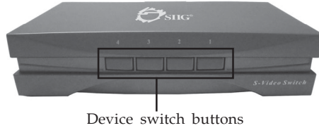
Figure 1: Front Panel