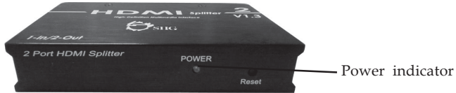
Figure 1: Front Panel