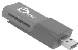
Figure 2: Showing USB Type A connector

Note: Slide down the USB port cover before using the card reader.