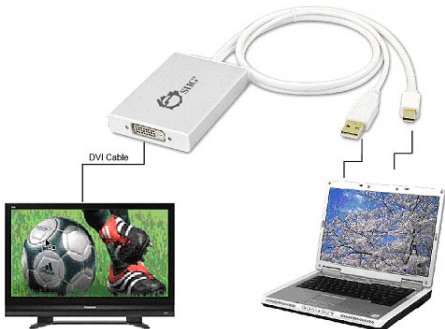
Figure 2: Application