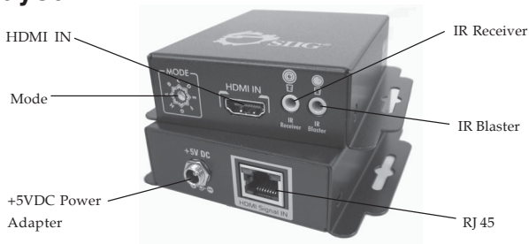
Figure 1: Transmitter - Tx (front & back)