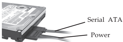
Figure 2. SATA hard disk drive connections