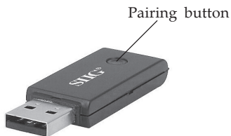
Figure 3: USB Wireless Receiver