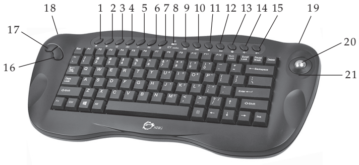
Figure 1: Top