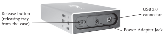
Figure 2: Back Layout