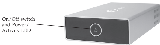
Figure 1: Front Layout