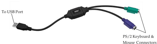
Figure 1: Layout