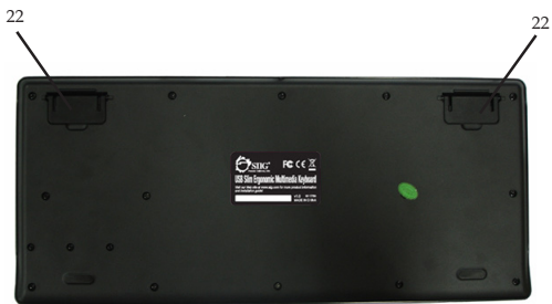
Figure 2: Rear Layout