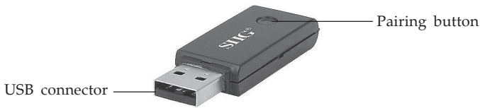
Figure 3: USB Wireless Receiver