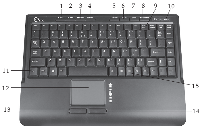
Figure 1: Top Layout