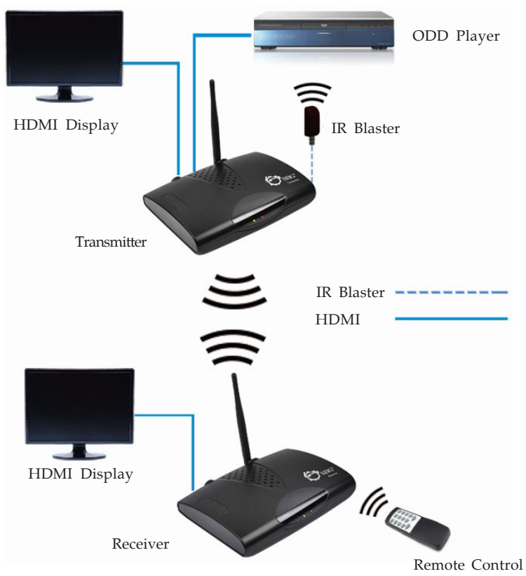
Figure 1: Application