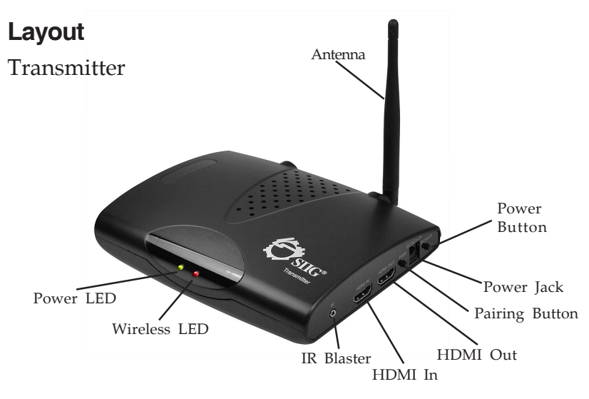
Figure 2: Transmitter Layout