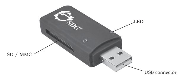
Figure 1: Layout