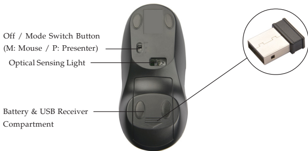
Figure 2: Multi-Task Wireless USB Presenter Mouse - rear