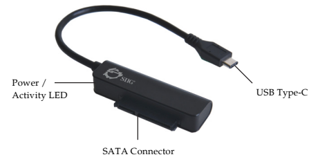
Figure 1: USB 3.1 Gen 1 to 6Gb/s SATA Adapter - Type-C