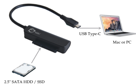
Figure 2: Application

Easily adds external 2.5" SATA disk storage through a USB Type-C port.