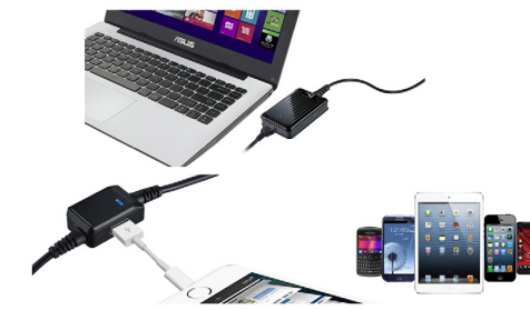
Figure 3: Application

The Ultra-Compact Universal Laptop Power Adapter allows you to charge your laptop and USB powered device simultaneously.