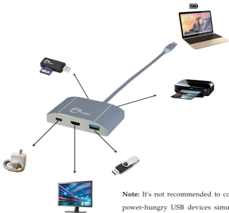
Figure 2: Application

USB 3.1 Type-C Hub with HDMI & PD charging Adapter -4K ready provides HDMI, USB data and USB PD charging connection simultaneously in one ultra-slim unit.