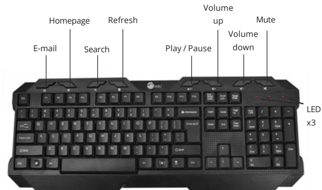
Figure 1: Front Layout