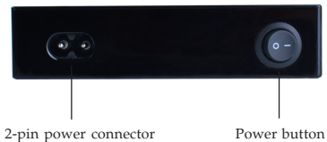
Figure 2: Rear side