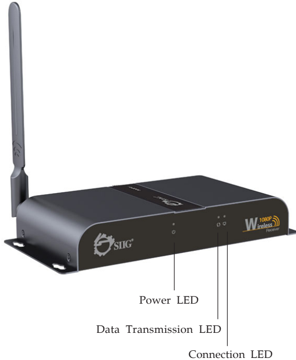
Figure 3: Receiver (RX) - front side