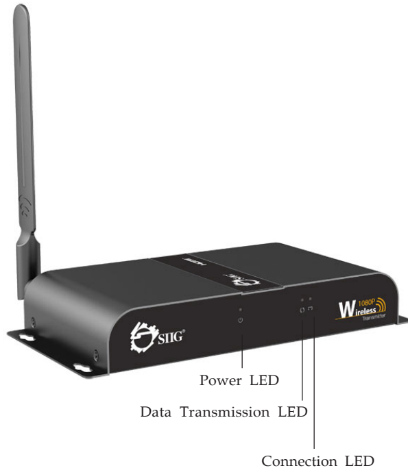
Figure 1: Transmitter (TX) - front side