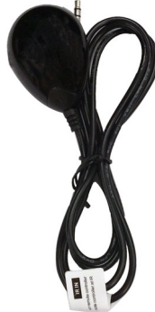
Figure 6: IR receiver extension cable (IR IN)