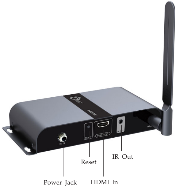
Figure 2: Transmitter (TX) - rear side