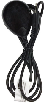
Figure 5: IR blaster extension cable (IR OUT)

The IR Extension feature allows you to control your HDMI source device from a remote location.