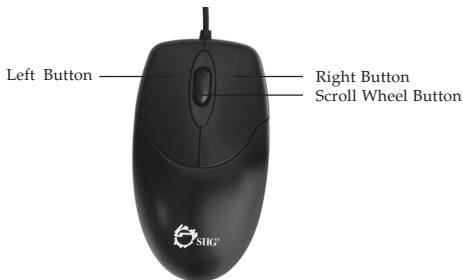
Figure 2: Wired USB Optical Mouse