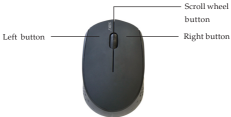
Figure 1: Top Layout