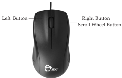
Figure 2: Corded USB Optical Mouse