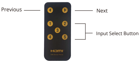
Figure 3: IR Remote Control