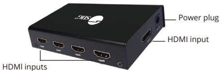
Figure 2: Rear side