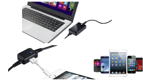
Figure 3: Application

The Ultra-Compact Universal Laptop Power Adapter allows you to charge your laptop and USB powered device simultaneously.