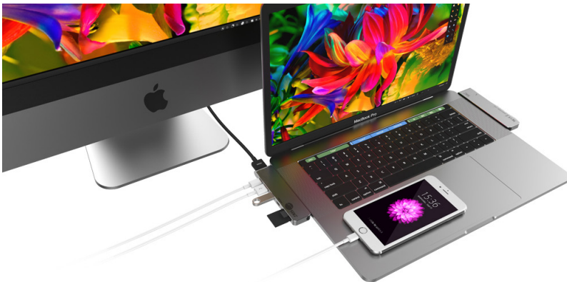
Figure 2: Application

Note: When you unplug the devices from the adapter, please handle it with caution.